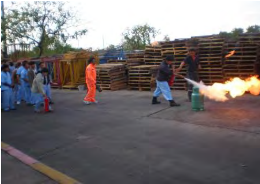
Training on using fire engine