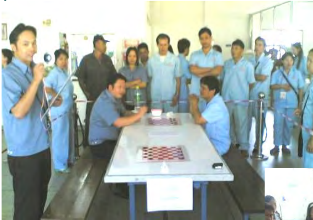
Horse games match (man / woman)